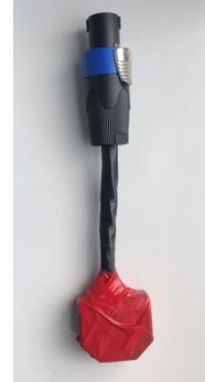
Air Horn Relay Switch