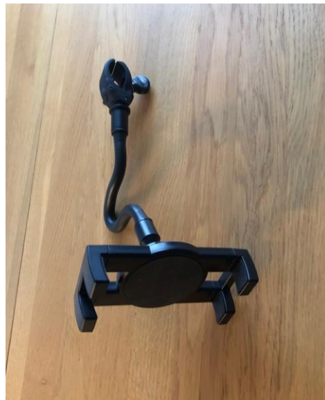
Gooseneck Tablet Holder